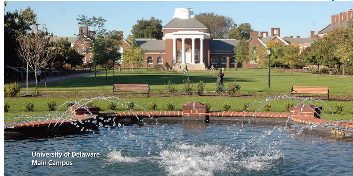
University of Delaware Main Campus

THE UNIVERSITY OF DELAWARE has grown from its founding as a small private academy in 1743 to a major university. The University offers an impressive collection of educational resources. The 16,000 undergraduate students may choose to major in any one or more of over 100 academic majors. The University's distinguished faculty includes internationally known scientists, authors and teachers, who are committed to continuing the University of Delaware's tradition in providing one of the highest quality undergraduate educations available in the United States.